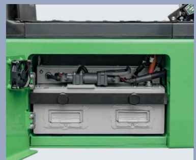
Lithium battery pack