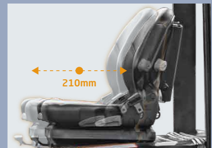
The seat can be adjusted back and forth by 210mm. The operator can choose the best driving position