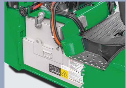
The packs can be easily removed by a manual or electric cart, and can be repaired and maintained conveniently