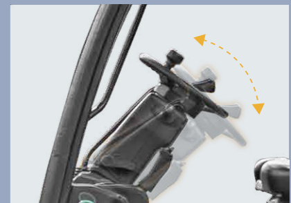
The ergonomically designed tilt-adjustable small-diameter steering wheel makes the driver feel good