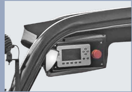
The dashboard in the driver's cab is placed overhead and can be seen when the driver lift her/his head, and the function buttons can be pressed easily